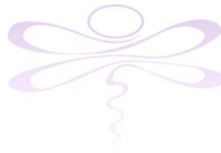
Sacred Whispers New Logo

Sacred Whispers has finally come up with a new logo, and are very excited about what it brings and the new beginnings it is creating. Very soon we will be releasing a new range of Essence Room Sprays, for clearing spaces, enhancing housework and happy home environment. They will be released at the Conscious Living Expo.